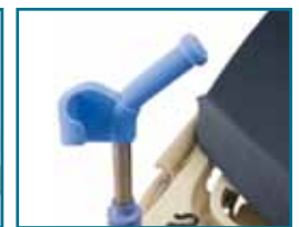
Ergonomic Push Handles