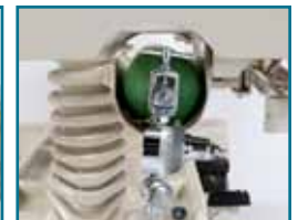
O 2 Tank Holder

Hill-Rom reserves the right to make changes without notice in design, specifications and models. The only warranty Hill-Rom makes is the express written warranty extended on the sale or rental of its products.