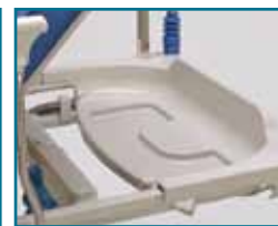
Integrated Utility Tray