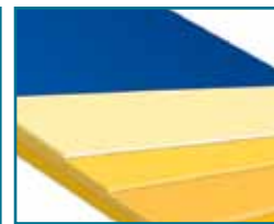
Tempur-Pedic® Medical Mattress