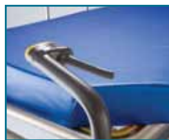
Active Hand Brake