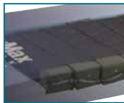
AccuMax Quantum™ VPC Mattress