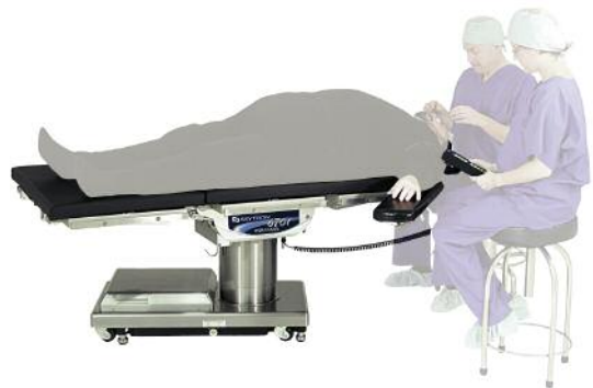
35° Rotation for ENT (Low Table Height to 23")

Exclusive 210° top rotation provides uncommon C-Arm flexibility and eliminates any conflict between Surgeon and Anesthesiologist during head-end procedures, while also providing generous leg room for standing or seated surgeons. A low height range of 23" off the floor is standard.