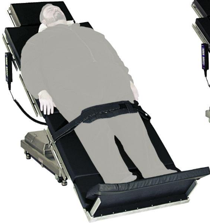
Table Side Extension 3-060-06 2" 3-Piece Sof-Pad Set (Bariatric) 1-010-35-BS 14" Bariatric Foot Extension 4-030-26 90" Restraint Strap 6-010-41-V

When a wider table top is required, the HERCULES 6701 provides simple and speedy set-up with side extension accessories that can quickly widen the table top to 30".