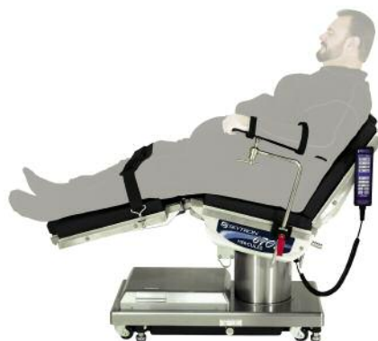
Automatic Beach Chair Position