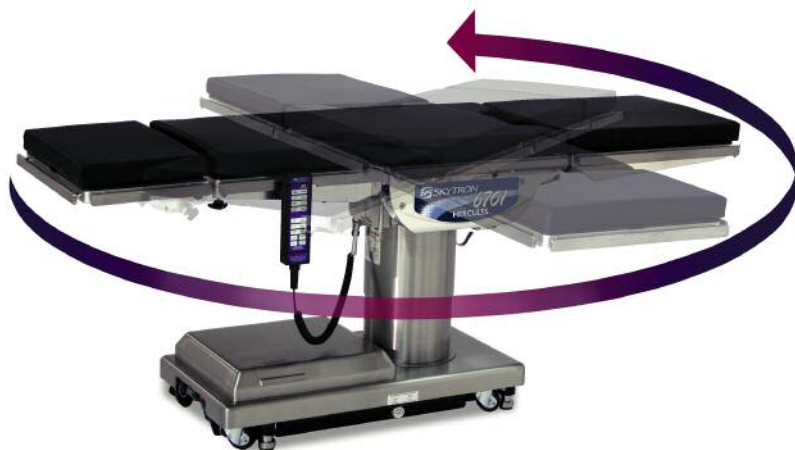
210° Top Rotation