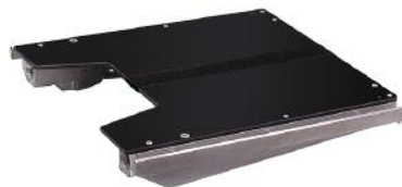
Removable Leg Section