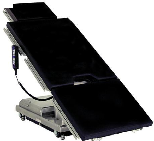
Table pads are available as shown above, or as solid 30" wide table pads. HERCULES 6701 is ready when you are, with unmatched Lifting Power, Ease of Patient Set-Up and Positioning Versatility for every procedure!

Solid 30" Table Pads with Side Extensions are also available.