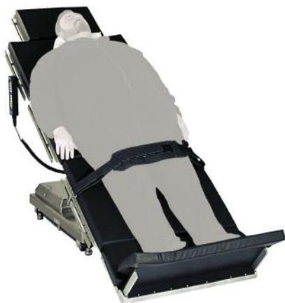
30" Table Top Expansion