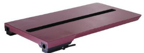
40" Carbon Fiber Back/Leg Section