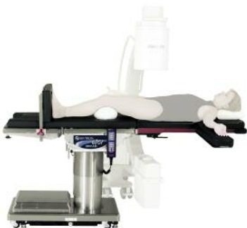
Upper Body Imaging