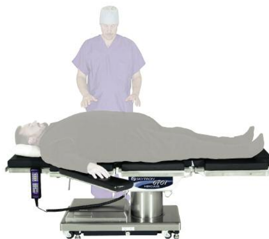
23" Minimum Table Height