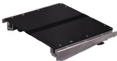
Removable Back Section

Benefits of Removable Back and Leg Sections include optimal anesthesia access for shorter patients in lithotomy position and enhanced leg room for seated surgeons. In addition, lower table heights can be more easily achieved by removing vs. lowering the leg section, thereby eliminating any articulation conflicts with the floor. Removable Back & Leg Sections also permit use of the optional 40" fully carbon fiber back/leg section for obstruction free imaging for Upper and Lower Body procedures.