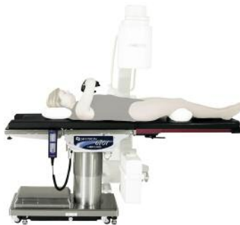
Lower Body Imaging