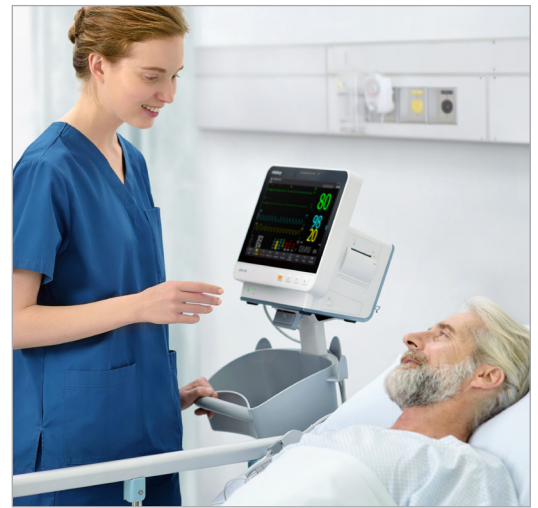
ePM 12MA with Expandable Minitrend Window